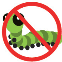
Don samun cikakken amfani wajen magance kwari da cutittika