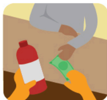
lokacin siyen maganin