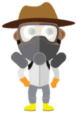
Don kare kanka