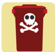
lokacin zubar da robar