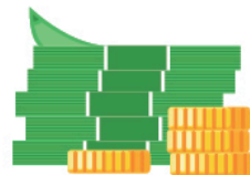
Rage kudin da zaka kashe da samun cikakken amfani