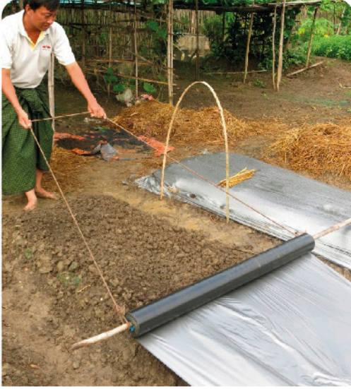
a warware gefen silba asama